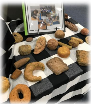
Year 2 creating clay model bread