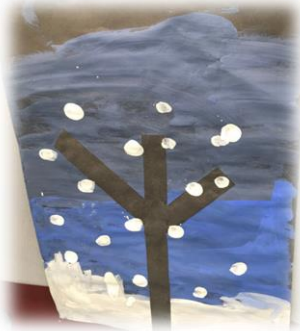
Reception creating winter scenes