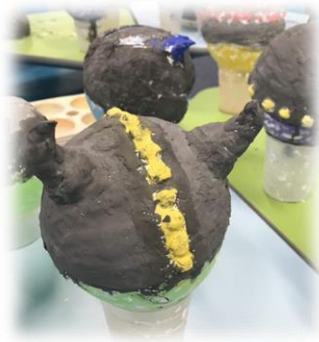
Year 4 creating Viking helmets using Mod-roc