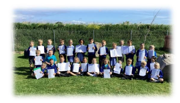
Year 1 Chestnut class have worked so hard to write their own finding tales!