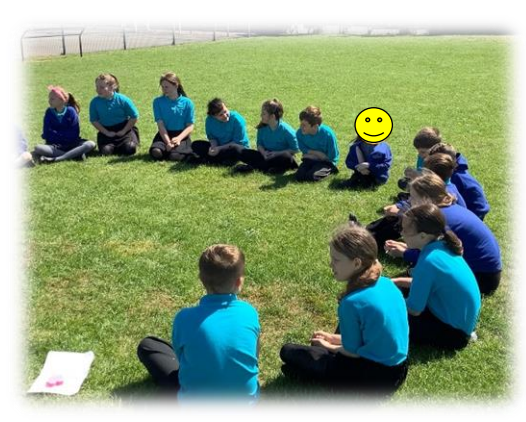
Year 5 taking advantage of the weather to enjoy and explore relationships within the 'Citizens education'