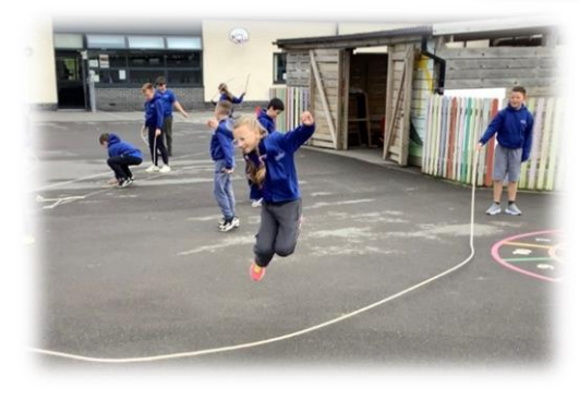
Year 4 Writers exploring the meaning behind their model text "How to skip"