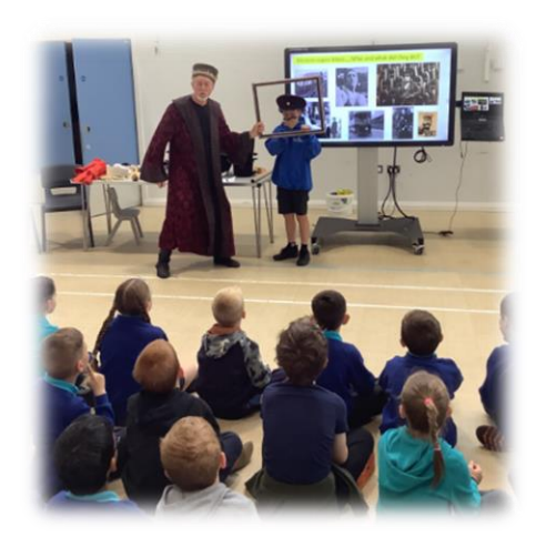
Year 2 visit to Noah's Ark Zoo Farm as

https://haywoodvillageacademy.clf.uk/curriculum/y ear-1/