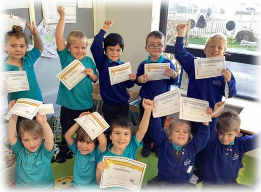
Reception children completing their reading challenges – learning to read is amazing!

Families can view learning experiences on the class pages on the school curriculum pages on the HVA webpage. Below is snapshot of some of the action: