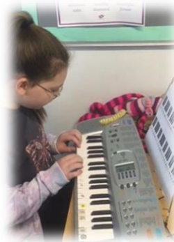
Year 5, as musicians, have been developing their keyboard skills.