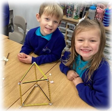
Year 1 designers exploring joins and structures this past week.