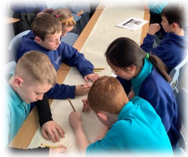
Year 4 historians designed their own version of the Bayeux Tapestry depicting the Battle of Hastings in 1066.