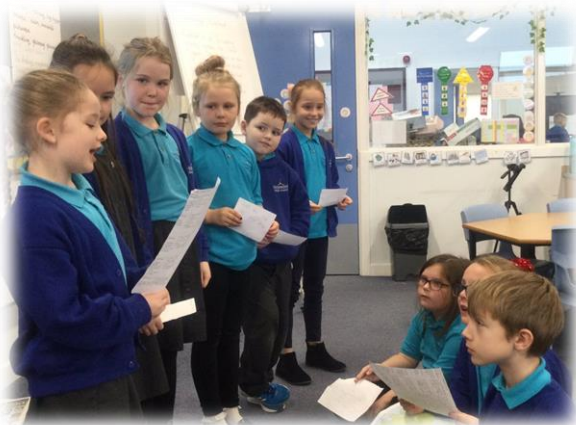
Year 3 geographers presented their planned inter-rail trips around Europe. They were all so confident guiding us around Europe.