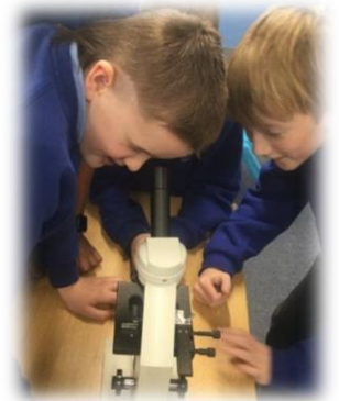
With the support of Winterstoke Hundred, our Year 6 scientists explored cells under microscopes.