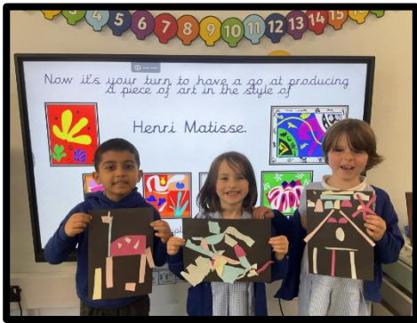
Year 1 have produced some fantastic collages this week.