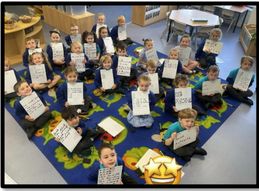
In Reception, writing standards continue to be exceptional!