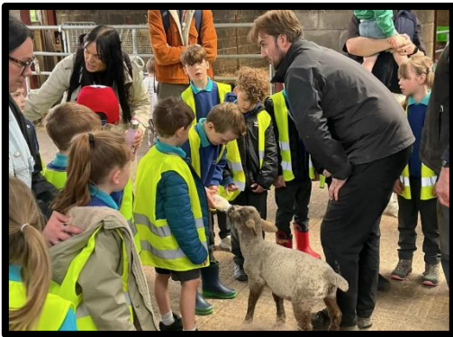
What a fantastic trip to Court Farm our Year 2 pupils had this week – thanks to all parents for supporting with this!