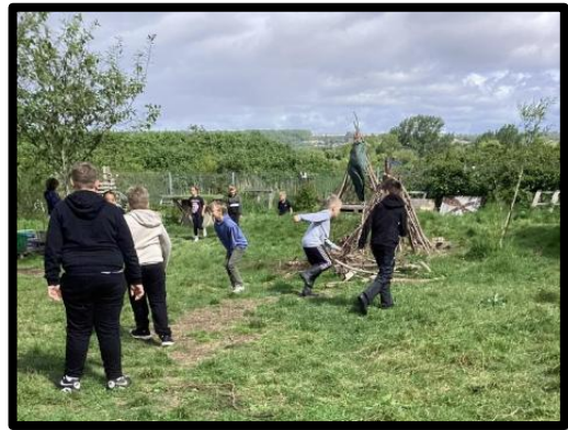
Year 5 have been out enjoying Forest School this week (and term).