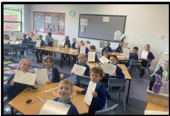
Year 3 mathematicians have been exploring and using perpendicular lines.