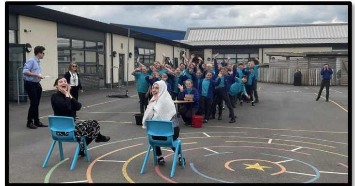
Year 6 have been preparing hard for, and completing SATs tests, over the last few weeks. This image is of a very exciting Spelling Bee competition!