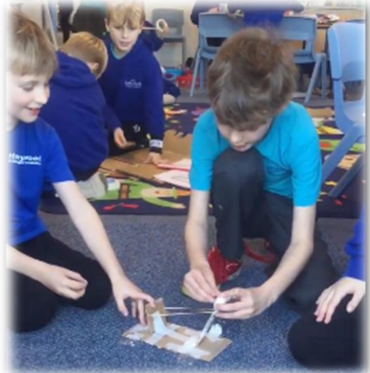
Year 3 designers creating their first successful catapult and trebuchet! Amazing prototypes during our designer's week.