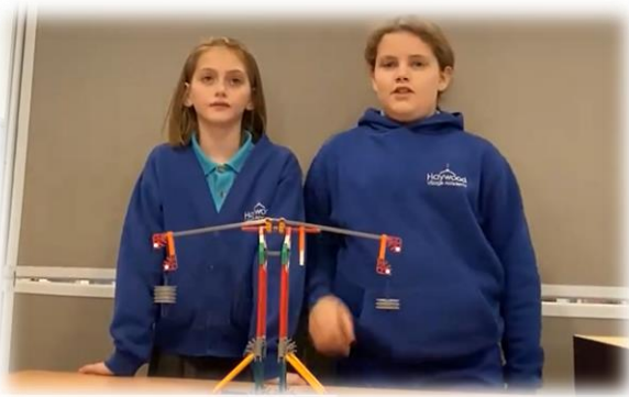
Year 5 designers exploring levers, with these two being able to explain their understanding.

https://x.com/HvaPine/status/1735218469807821035?s=20