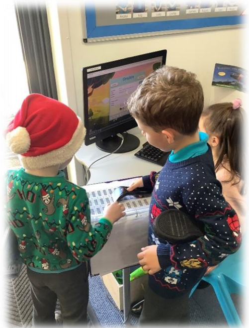
Year 2 visiting the school library on Save the Children's Christmas Jumper Day.