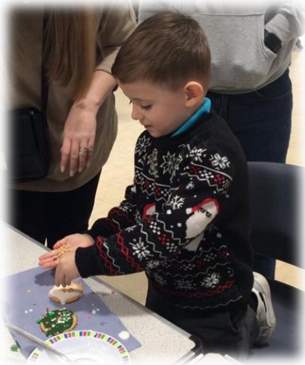
Pre-school had a great time at their Christmas craft and sing-along. The most popular table was the biscuit decorating!

A busy last week in school has seen a mix of seasonal fun and lots of opportunities for the 'designers' curriculum.