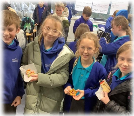
As mathematicians, Year 6 used scales to measure out ingredients for our Christmas shortbread.

https://x.com/HvaPine/status/1735218469807821035?s=20