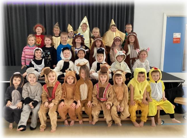
Beech and Birch class in Reception put on a wonderful nativity show of 'Wriggly nativity'.