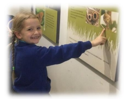
Year 3 children visiting Cheddar Gorge – Geographers on a field trip!

Children enjoying drawing club this week.