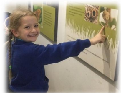
Year 3 children visiting Cheddar Gorge – Geographers on a field trip!