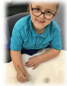
Children enjoying drawing club this week.