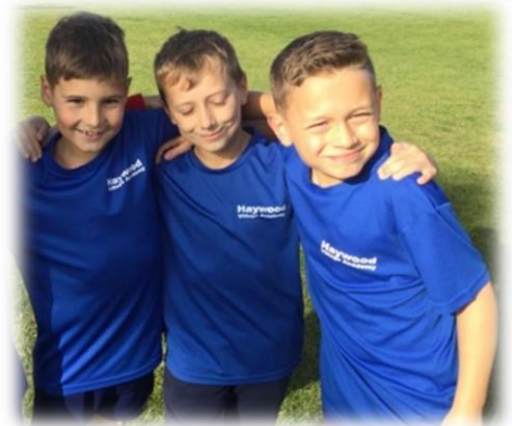
Children in Year 3-5 represented the school at a cross country event in Bristol this week.

You can always view the learning opportunities that take place at HVA on the year group pages that can be found on the year group webpages: https://haywoodvillageacademy.clf.uk/