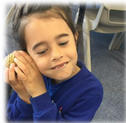
Year 2- A mysterious egg has been found and inspired our writers.