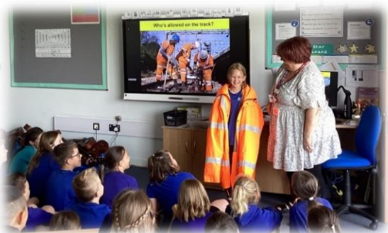
Year 5 children refreshed their knowledge about safety and the railways from visitors from Network Rail.