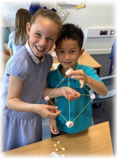
Year 3 Mathematicians having fun making 3D shapes (with spaghetti and marshmallows!)