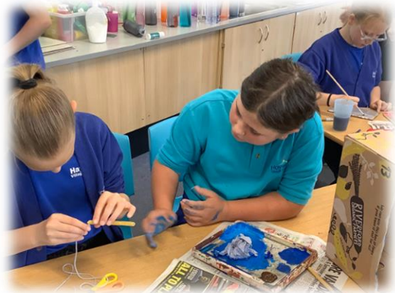
Year 6 sharing poems with Year 1 and being very industrious with their stop-motion animation set-building.