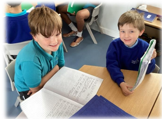
Year 1 children sharing their poems with Year 6