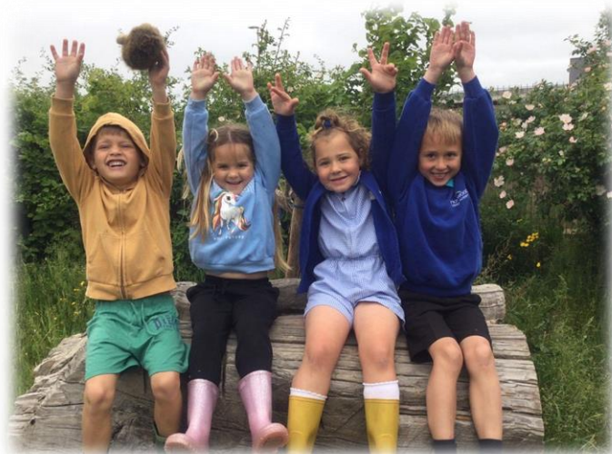
Reception enjoyed their first Forest School lesson last week.

So far already there is busy-ness in the children's learning. More images can be seen on the website curriculum year group pages.