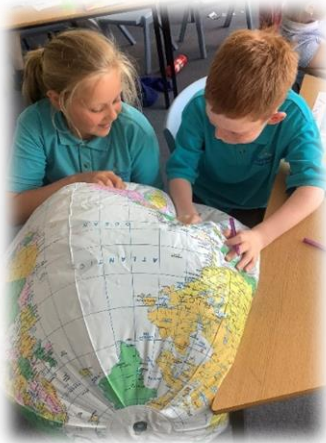
Year 4 children have been studying Buddhism as Religiously Conscious learners and have been learning about the 'Noble Eightfold Path'. They've also been locating places around the world.