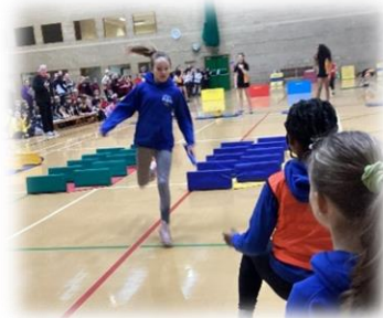
Year 6 athletes competing in the Sporthall Athletics competition at Hutton Moor.