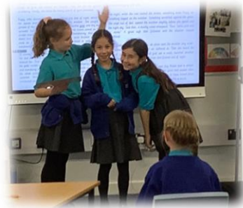
Year 4 have had great fun developing their drama skills as part of their writing lessons.