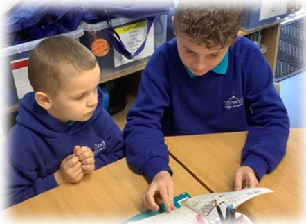
Year 1 and Year 6's reading together