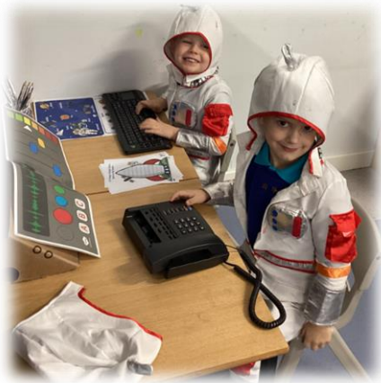
Reception children enjoying their roleplay in a Space Station.

Families can view learning experiences on the class pages on the school curriculum pages on the HVA webpage. Below is snapshot of some of the action: