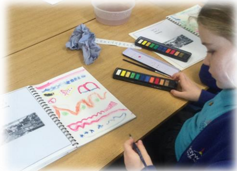
Year 3 artists learning how to use watercolours to create lines and patterns.