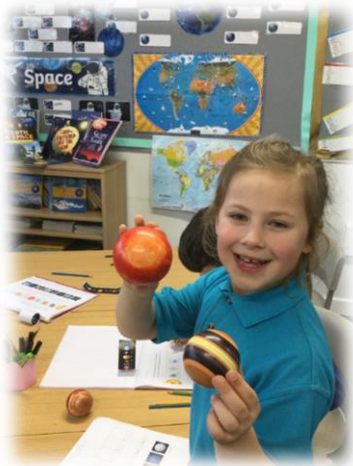
Year 2 have begun learning about Space as scientists!