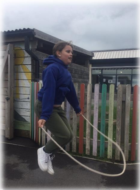
Year 4 writers explored a text titled 'How to skip for fitness' and of course had a go themselves!