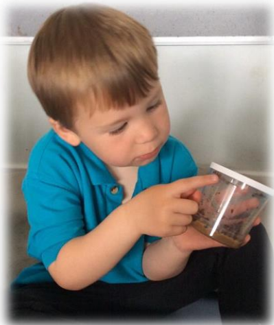
Pre-school children have been learning about butterfly lifecycles.

Below are some pictures from learning opportunities across the school this past few weeks. You can always view more updates on the Curriculum pages on the school website.