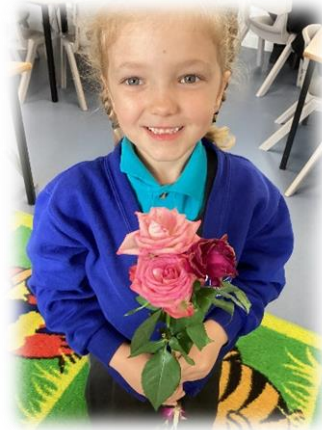
Year 1 combined their science knowledge and writing skills to create a fact-file on how to care for flowers.