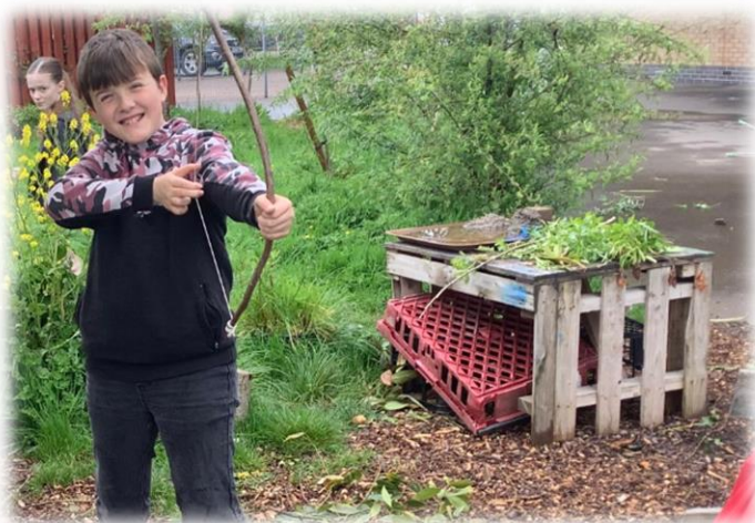
Year 5 enjoyed Forest School – making using nature. This week, some children made nettle pancakes and some made bows.