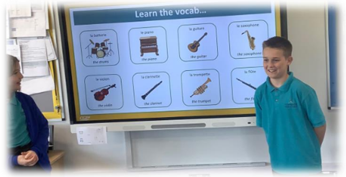
Year 6, as modern foreign linguists, explored the French language, in particular how to talk about their preferences for hobbies including music.