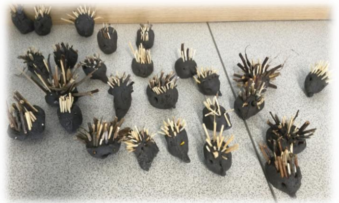
Year 2 had help from their RSCPA visitor to help them learn more about the science and geography of habitats.