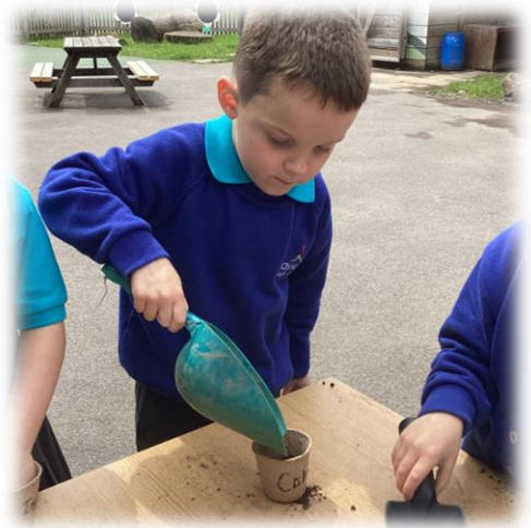
Linked to their writing and enquiry about plants, Reception children have planted their own (Jack and the) beanstalks!