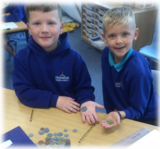
Year 3 mathematicians have been learning about money.