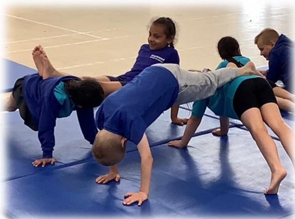
Led by Gemini Gymnastics, Year 2 gymnasts were developing their balance and teamwork skills.