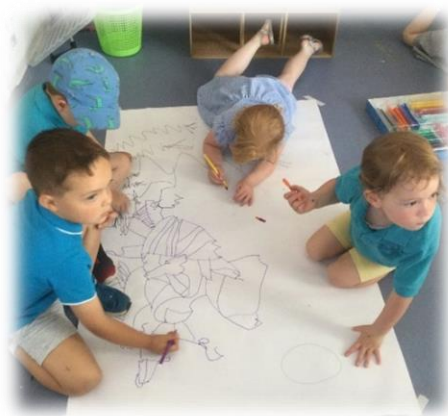
Pre-school have been creating their own maps alongside each other and together.

The school website captures some of the learning from the past few weeks: