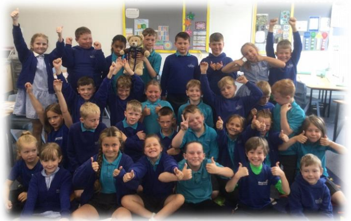
Year 3 Hawthorn were delighted to receive Captain Ted – the attendance mascot – as they had the highest attendance in school (nearly 100% for the week!)