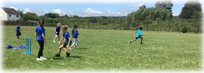
Year 5 learning and competing in cricket in their PE lessons.