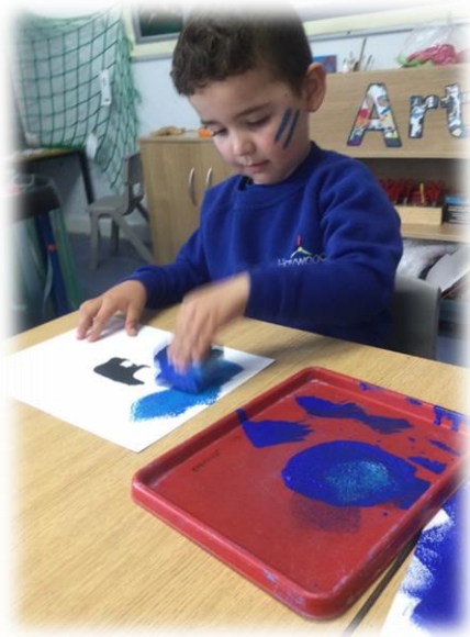
As artists, Reception children explored printing through their Under the Sea theme of enquiry.