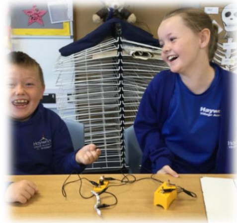
Lightbulb moments in Year 4 as they continue to experiment with electricity! They have also been making prototypes of lamps based on their designs. When making these they used knowledge from their learning on structures to make their lamps stand. They also used their scientific knowledge of circuits to know what components they need to fit into their lamps.