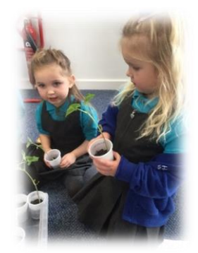
As scientists, Pre-school are proud of the plants they have grown.