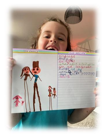
As socially aware learners and as part of LGBTQ+ awareness month, Year 1 discussed a 'recipe' for a special family.