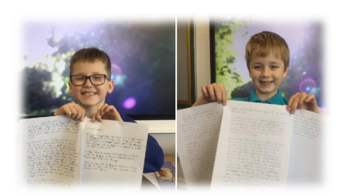
As writers, Year 3 proud of their recent published stories.