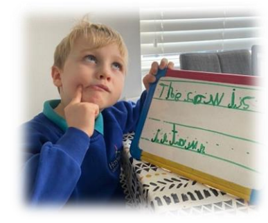
Learning to write, at home, in Reception.

Whilst wearing uniform, sat ready to learn, in their own space to work and alongside the support of parents, children have accessed live lessons. Similarly, children in school have been taught by our dedicated team in school.