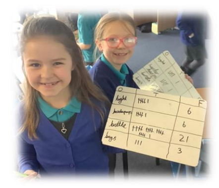
Year 3 enjoying being mathematicians.