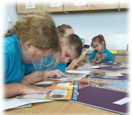
Year 4 have enjoyed ERIC (Everyone Reading In Class) time after lunch to support them to develop their reading skills.