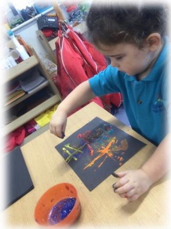
Pre-school exploring art about firework displays.

Here are some pictures and descriptions of learning in school in the past few weeks: