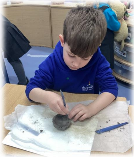
Reception artists have been celebrating Diwali this week by making Diwa lamps. They drew a plan of their designs, then created the designs using clay!