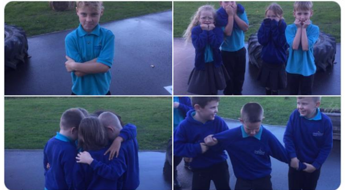
As historians, Year 3 learnt about the Gunpowder Plot and Guy Fawkes. Here they are creating a living timeline of the events that occurred on the 5th of November, all those years ago!