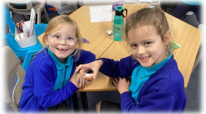
Year 2 scientists have planted cress seeds and thought how they will help them grow.