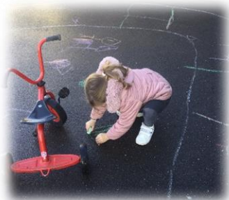
Pre-school creating their own road system, drawing the traffic lights to keep the traffic moving.

Families can view learning experiences on the class pages on the school curriculum pages on the HVA webpage. Below is snapshot of some of the action: