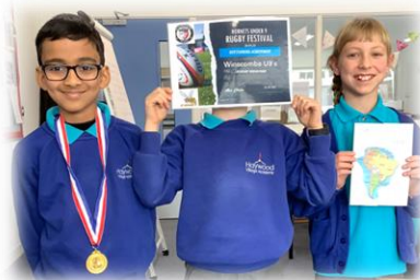
Year 4 sharing their achievements from outside of school.