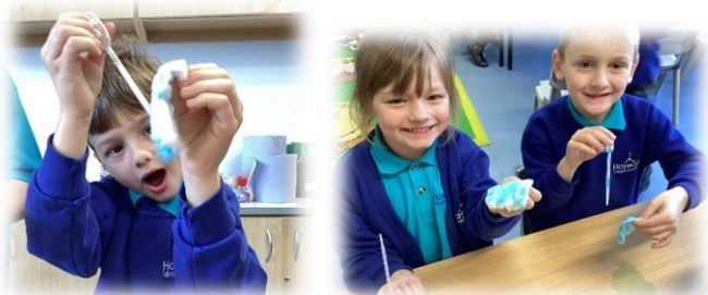
Year 1 scientists using cotton wool and water to explore the concept of rainfall.