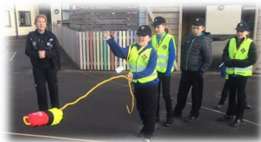
Year 6 Mini-police learning to be safe in the community – using life-saving water aids.