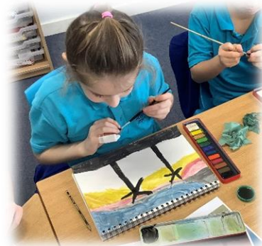
Year 5 artists painting renewable energy in a 'Van Gogh' style.