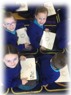
Year 2 creating shapes and annotating their properties (edges and vertices)