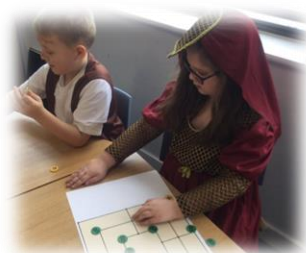
As historians, Year 3 dressed as Tudors played games and danced.