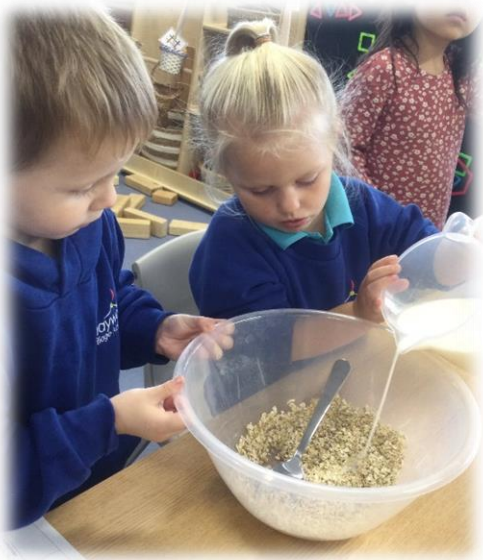
Pre-school Apple class have been making porridge, just like the bears in their story.

You can look on the curriculum pages of the school website to see what the children have been learning this week.