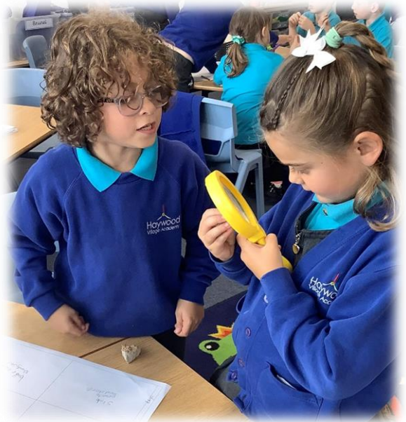
As scientists and geographers, Year 3 were exploring geology by taking a closer look at rocks.