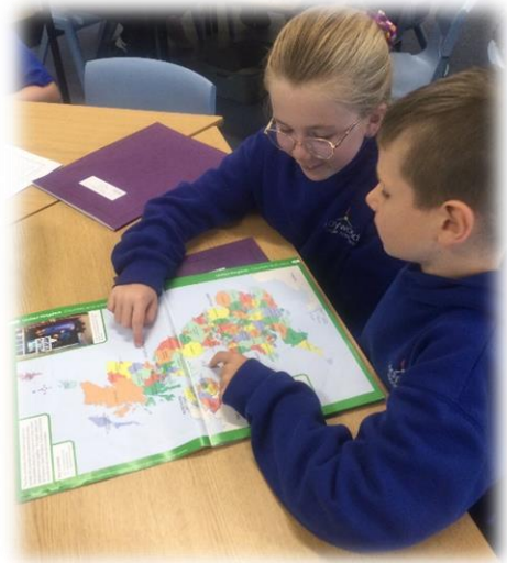
Year 4 geographers have explored maps and identified their place locally, regional, nationally and globally.