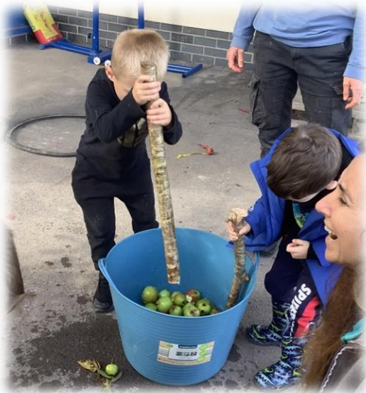
Year 1 out in Forest School pulping apples ready for apple pressing to make apple juice.