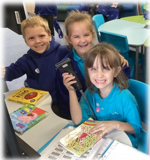
Year 2 librarians signing books in and out for the children in their class.